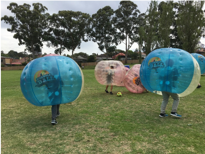
Some photos from Cantervale on Friday 13 th November 2020.